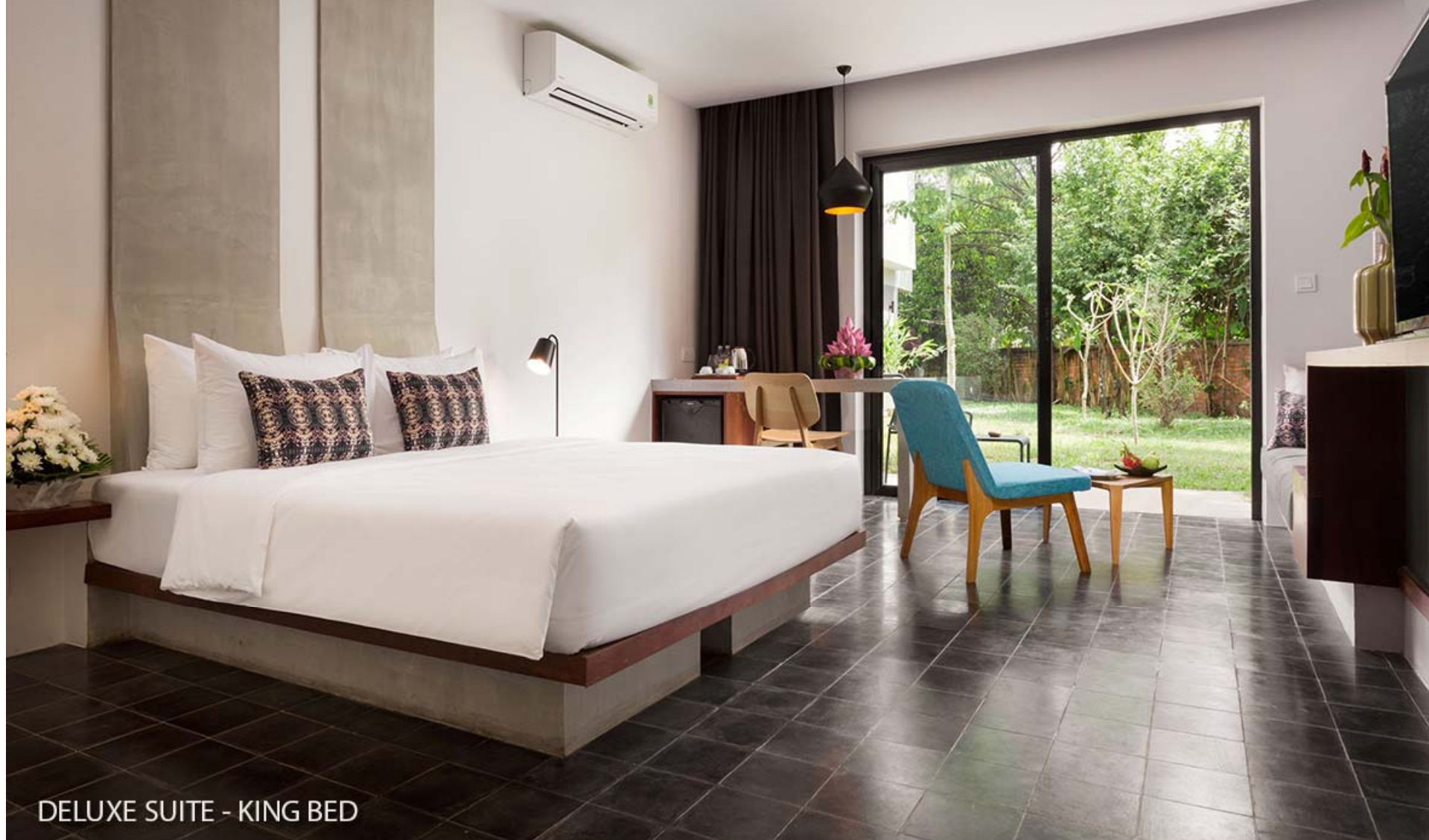
DELUXE SUITE - KING BED