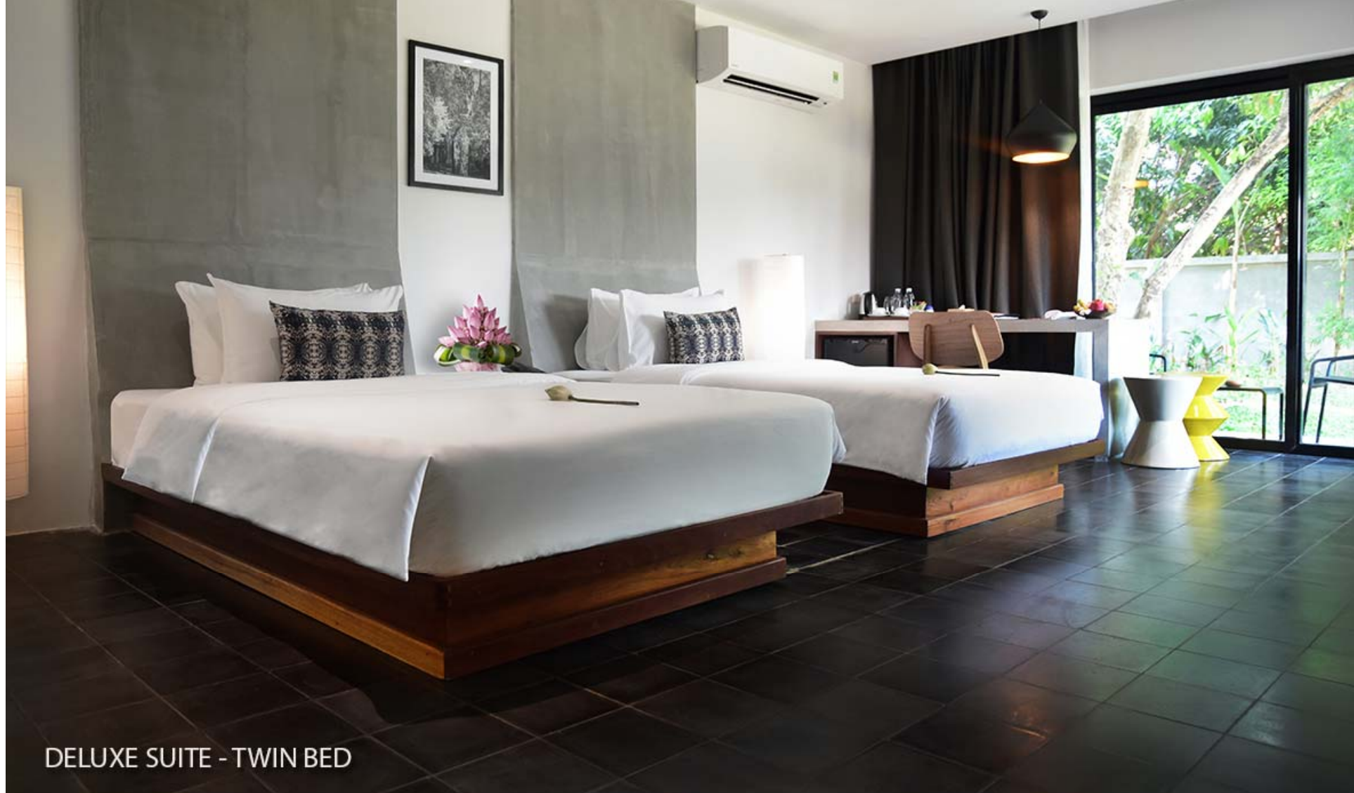
DELUXE SUITE - TWIN BED